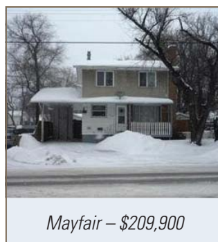
Mayfair – $209,900

Low interest rates and improved inventory levels have contributed to a serious upswing in home-buying activity in Saskatoon this year. Close to 480 homes have changed hands from January 1 to February 28, a 15 per cent increase over the 413 sales reported during the same period in 2010. Average price has followed in lock step, with year-to-date values climbing four per cent to $292,463. First-time buyers, including young couples and singles, are in large part behind the push for homeownership, driving sales of entry-level homes across districts one through five. While affordability is a growing concern, most purchasers have incomes that easily support their housing choices. Many are choosing post-war homes—priced in