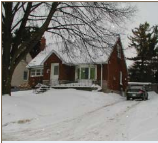
East End – $149,900

up for their choice location. Some purchasers accelerated their home-buying intentions, choosing to move ahead of the March 18th deadline that saw the maximum amortization period shortened from 35 years to 30. Given London's affordable price points, there's no question that it can make a difference in the size