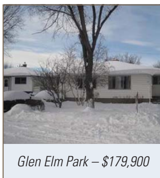
Glen Elm Park – $179,900

at $230,000 for a 1,300 sq. ft. unit with a single-attached garage, but those entry-level buyers intent on owning a single-family home in the city will have to move closer to average price to realize ownership. An 800 sq. ft. bungalow typically starts at $275,000 in the northwest, in an older, established area like Sherwood and Normanview. More affluent first-time buyers are considering properties in the city's south end, hovering at $350,000 for a 1,600 sq. ft. home. Gentrification is occurring to some extent in some of the city's older neighbourhoods, including the General Hospital area, but the process is happening one block at a time. Sixty-one single-family properties are currently listed for sale between $275,000 and $350,000, while 65 condominiums are priced under $200,000. Unlike past years, buyers in today's market are typically looking for turnkey properties. After closing costs, there is usually little money left for renovation or upgrades. Homeownership, however, continues to resonate with purchasers in Regina and the trend is expected to continue as the province leads the country in economic growth. With five-year mortgage rates available as low as four per cent, the carrying costs are not that significantly different than renting in the city.