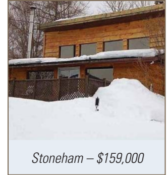
Stoneham – $159,000

comprise the vast majority of Québec City homebuyers, with very few singles in the marketplace. New financing criteria has had little impact on the local market, although there has been an upswing in activity reported in recent weeks—credited to improving weather conditions and strengthening consumer confidence. With an ample selection of product available for sale at all price ranges and increasing demand, a solid spring market is forecast.