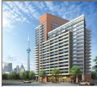
King West, Queen West $319,900

C01, bordered by Lake Ontario to the south, Yonge St. to the east, Dufferin St. to the west, and Bloor St. to the north, home to Toronto's condominium boom, is the hub of new and resale activity in the GTA. Just 77 resale apartment and town house units are currently listed for sale under $275,000 in the