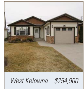
West Kelowna – $254,900

under the $260,000 price point. However, very few options exist under the same threshold in the single-family category, with just 39 homes currently listed for sale—most of which can be described as handyman specials. Those opting for condominiums will find 151 one-bedroom units currently listed for sale, with an average asking price of $255,000, typically averaging 800 sq. ft. Apartment-style units can start as low as $200,000 in older areas of the city that are being revitalized. While affordability is an issue for some, a growing number of first-time purchasers are spending amounts closer to average price, typically between $350,000 and $400,000. Residential average price currently hovers at $390,000. Popular are starter homes located in established communities, including Glen Rosa, Rutland, and North Glenmore on the peripherals, as well as Central Kelowna. Starter product can run the gamut from newer construction to older, renovated homes. Buyers that can afford it are choosing to ante up to secure the best location possible for the dollar, while those on a strict budget will look to the peripherals—a reasonable trade-off, placing suburban homeowners just twenty minutes from Kelowna proper. The greatest opportunity that exists at present for entry-level buyers are prices that remain off year-ago levels. Housing values have been relatively flat over the past six months, but the gap is now closing