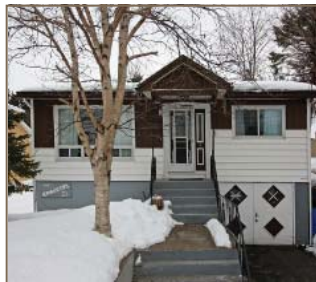
Conception Bay South $169,900

Demand for housing in St. John's remains healthy, particularly among first-time buyers, despite a decline in year-to-date sales. Buyer's market conditions and the best choice of product in years have buoyed the entry-level segment, along with wage gains, economic growth and rising consumer confidence levels. Affordability continues to be favourable, with increased earnings offsetting the more moderate price growth of late. Most young homebuyers are now active from $200,000 to $250,000. Those buying new construction will have to ante up more—typically between $230,000 and $280,000 to start—as the price of new construction has risen at a greater rate. Those on a tight budget will find that homes listed below $200,000 are few and far between and tend to sell for close to full price, if listed at fair market value. Some even generate a rare multiple offer. To illustrate the supply issue, only 34 homes have sold year-to-date under $175,000, accounting for just 10 per cent of all sales, and only 39 listings under that price point are currently available. Given that, buyers at the lowest end of the price spectrum will have to act more quickly. The housing mix in St. John's continues to favour the single-detached