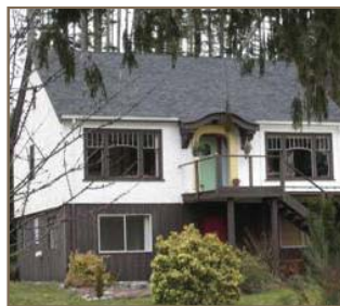
Sooke Centre – $320,000

While there's little yard to speak of, the neighbourhoods have been designed with plenty of green space, park trails, and recreational areas sought-after by young families. Those seeking out detached homes are laying down roots in areas such as Langford, Colwood, View Royal and Sooke. Despite the necessity of being budget-