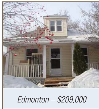
Edmonton – $209,000

weeks ahead. Homeownership remains well within reach of most first-time buyers in Edmonton. Demand is heating up after one of the worst winters on record. As purchasers thaw, so too will the residential real estate market. From an economic standpoint, performance continues to improve. The price per barrel of oil hovers just over $100 and that's sparking renewed activity in the oil patch. Recent announcements—such as the plan to move forward on the $5 billion upgrader project in Redwater, a decision that will create 12,000 construction jobs and 1,200 to 1,500 permanent jobs over the next five years—have provided a tremendous boost to consumer confidence in the area. Unemployment levels are also dropping in the city, with more and more help wanted signs appearing in store windows. With interest rates forecast to remain fairly attractive, home-buying activity is expected to continue to rebound, while prices remain stable, edging up slightly over the remainder of the year.