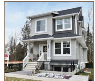
Cloverdale – $512,000

Robust demand for residential real estate in Greater Vancouver in 2011 has pushed housing sales and values well ahead of 2010 levels. Both first-time and move-up buyers are leading the charge, especially in areas like Richmond and Vancouver Westside, where sales have been particularly brisk. Close to 5,000 homes have changed hands to date, up approximately 12 per cent over the same period one year ago. Average price now hovers at a record $780,000. Erosion in affordability levels has been significant in recent years, yet first-time buyers continue to enter the market, explaining the 44 per cent of freehold and condominium properties selling under the $500,000 threshold so far this year. Many entry-level purchasers are compromising on their housing choices, scaling back on expectations, sacrificing quality or size to realize homeownership. Some are moving further east or south of the city to communities that stretch the dollar a little further. Langley, Surrey and Cloverdale offer new or newer