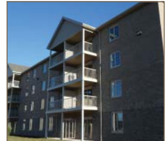
Downtown – $115,900

With a good selection of product—and something for every budget—homeownership in Moncton remains attainable for most first-time buyers. In many cases, owning compares to renting, so it's no surprise that entry-level purchasers continue to drive momentum in Moncton's residential housing market.