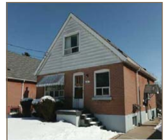
Central Mountain Area $214,900