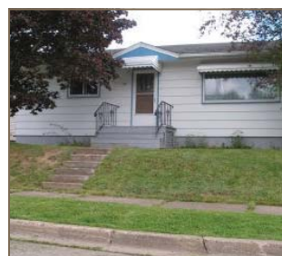
North End – $114,900

Year-to-date real estate activity is well ahead of the 10-year average (256 units)—by nearly 30 per cent, in fact—with sales reaching 332 units at the end of February. Boasting one of the highest affordability levels in the country, with an average price now hovering near $155,000, purchasers in Moncton are well-positioned, particularly given today's rock-bottom interest rates. Most making their first foray into real estate are now spending between $120,000 and $150,000, and some are anteing up to $250,000 to secure location. While properties can be had for well under $100,000, the vast majority under that price point tend to be seasonal properties or mini-homes. Sales under $120,000 account for just